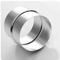
Hose connector Sheet steel connector for extending, connecting and joining light to medium-weight hoses