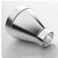
Hose Reducer, symmetrical Hose reducer for extending, connecting and joining light to medium weight hoses