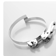
Clip-Grip Quick-Fix Clamp Special clamp for attaching all hose types from the Master-Clip series to mobile and stationary units.