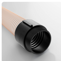
Combiflex PU threaded connector, fixed cast-on fixed PU threaded connector for all Master-PUR L, Master-PUR H and Master-PUR HX hose types, based on DIN ISO 228