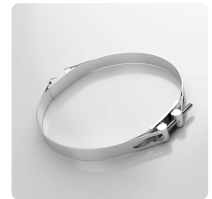
Hose Clamp with Bolts special clamp for fastening medium and heavy spiral hoses to connection pipes on mobile and stationary units