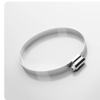
Hose Clamp with Worm-Gear Standard clamp for fastening light hose types to connecting pieces on mobile and stationary installations